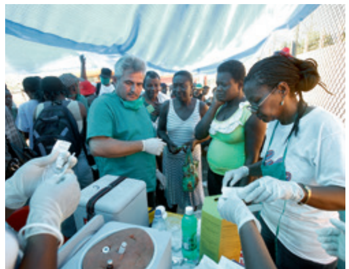
WHO provides vaccinations against diphtheria and tetanus at Port-au-Prince's National Stadium, where many Haitians displaced by the earthquake have set up temporary shelters.

Ill-health related to chronic disease is rising across the world. A large part of this disease burden is caused by so-called lifestyle choices, such as smoking tobacco, drinking alcohol, overeating, and not exercising enough. What ethical obligations do governments have to try to change such behaviour? For example, we know that smoking is harmful and linked to the death and suffering of millions of people each year. It is also a deeply entrenched, often addictive, behaviour. At the same time, autonomous adults generally have the right to engage in risky behaviour, as long as their actions do not put other people directly at risk. In this context, to what extent do governments have an ethical obligation to adopt policies that reduce the harm resulting from smoking? Should governments use the tax system to deter individuals from starting or continuing to smoke? Is it acceptable to place limits on the advertising of