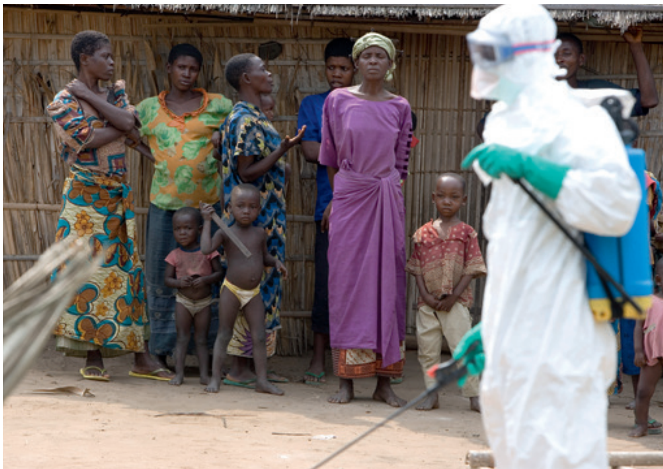
Local health staff work with experts from Médecins Sans Frontières to disinfect the house of a patient who died of Ebola. Democratic Republic of the Congo, 2007.