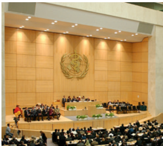
The 60th World Health Assembly opens in Geneva, Switzerland on Monday, 14 May 2007.

In 2002, WHO established a dedicated ethics team, which is now called the Global Health Ethics Unit. Through this