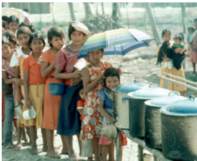
Guatemalan children living in refugee camps in the State of Campeche wait to get their food ration.