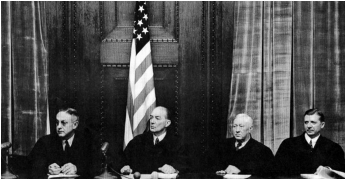
Judges of Military Tribunal No. 1, Nuremberg, Germany, 1946–1947.